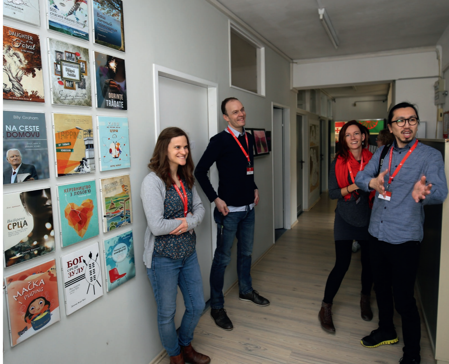
Welcome to OM EAST! Tour of the literature and media office during OM EAST's 50 th Anniversary celebration.

Unless otherwise stated, all Scripture quotations in this publication are from the HOLY BIBLE, NEW INTERNATIONAL VERSION® NIV® Copyright ©1973, 1978, 1984, 2011 by Biblica, Inc.®. Used by permission. All rights reserved worldwide.